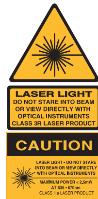
AS 2 MAGNUM